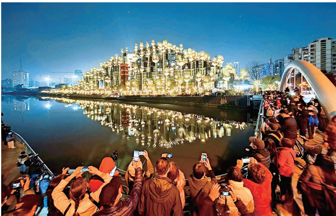
A new landmark shopping complex along the Suzhou Creek in Shanghai, dubbed the city's Hanging Gardens of Babylon, opened on Wednesday. The initial phase of the "Tian An 1000 Trees" project includes restaurants, museums, art galleries and entertainment sites, along with the city's earliest industrial heritages. — Wang Rongjiang and Jiang Xiaowei